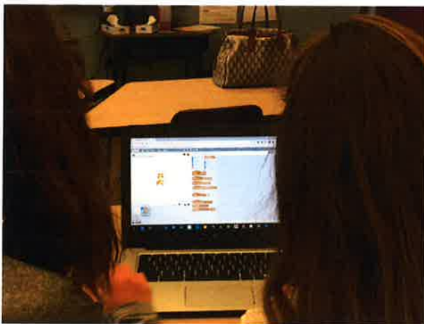
Coding with Scratch and Interactive Research Posters

M2: We will deliver a comprehensive and engaging curriculum for a diverse student body.