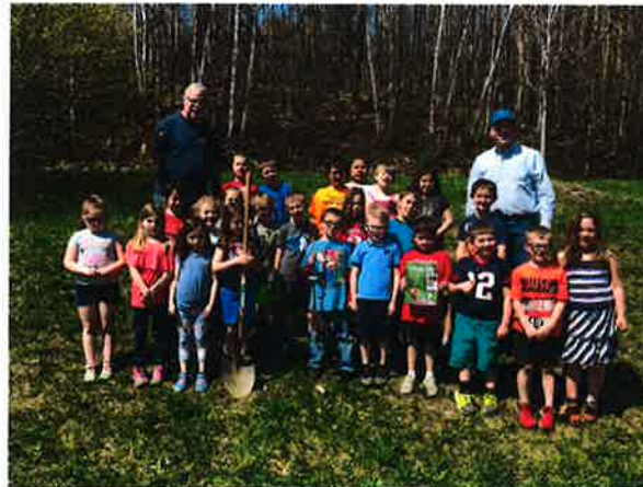
Northwest students celebrate Arbor Day with Rutland Rotary by planting trees in the community.

M1: We empower students to be accomplish individuals and community members. Students will be productive members of the school and community.